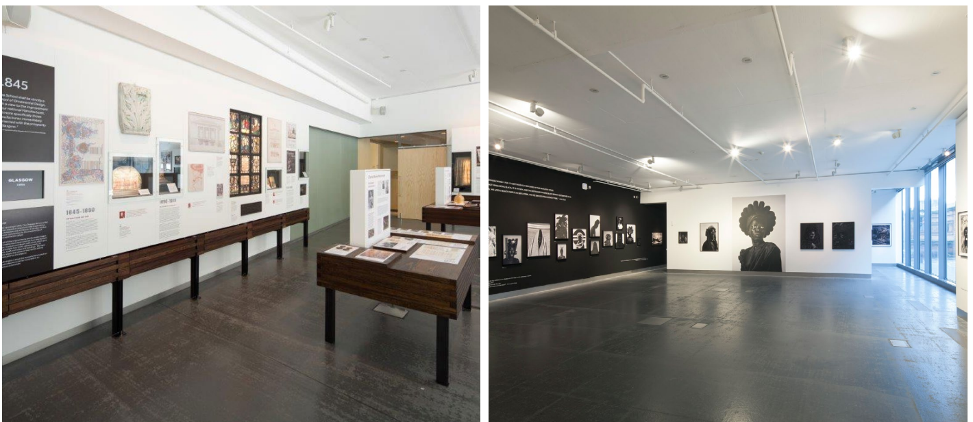
Internal view of Window on Heritage and the Reid Gallery

Seating is available to the right of the main reception for visitors, as well as a concrete bench further along the corridor opposite the toilets. There are gender neutral toilets (including an accessible toilet) located on the ground floor next to the Reid Gallery. All toilets are closed stalls.