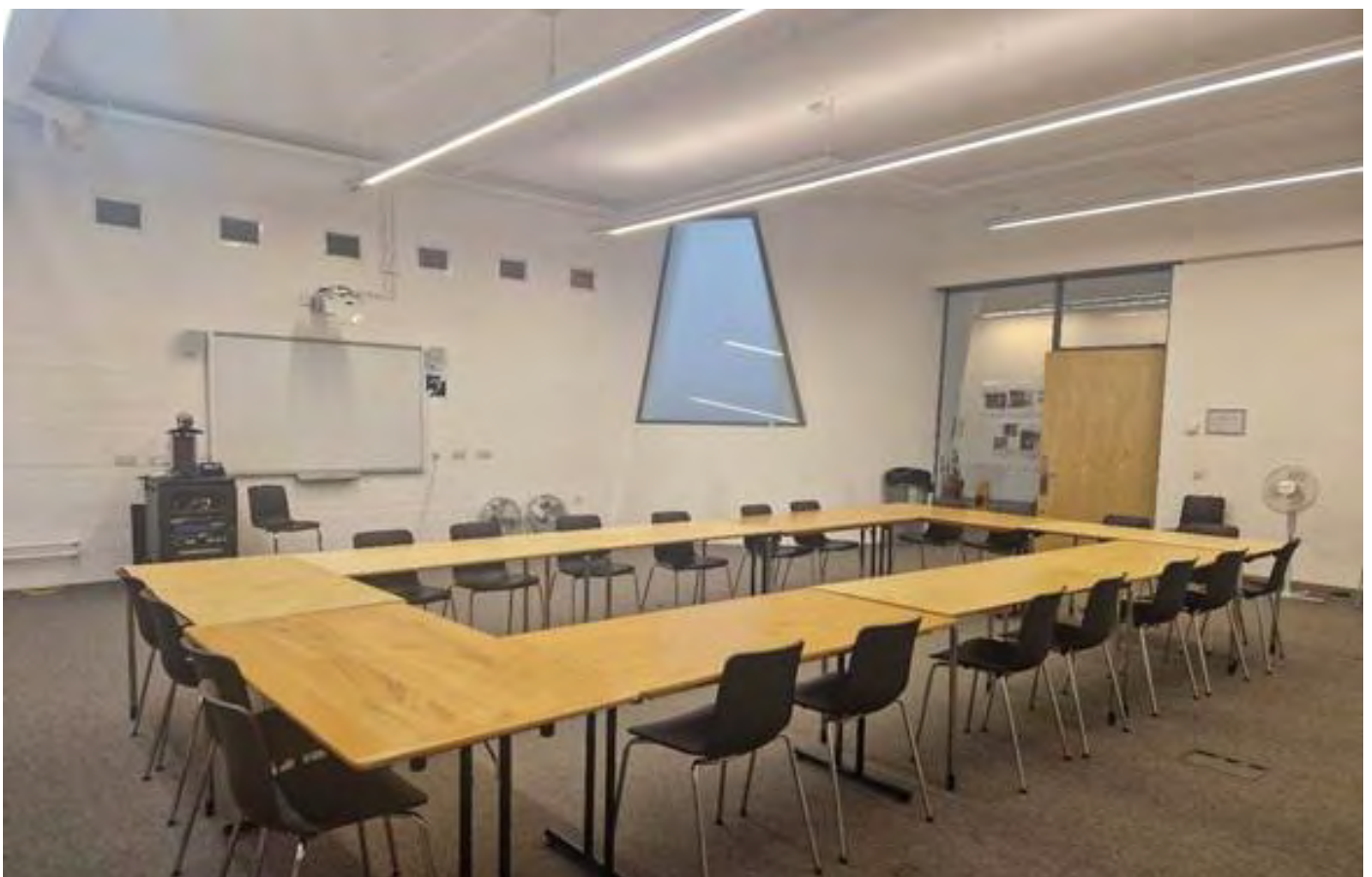
Internal view of Reid Ground Floor Corridor

The Seminar room is located at the bottom left of the Reid Ground Floor corridor, before the driven vound at the bottom of the corridor. The Seminar is wheelchair accessible and has step free access.