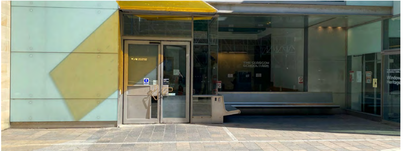
Reid Building Main Entrance (Renfrew Street)

The best drop off point for a car or taxi is at the drop kerb outside at the Reid Building Main Entrance at 164 Renfrew Street. There are additional drop off points with drop kerbs at the corner of Scott Street and Renfrew Street, outside the GSA library building or outside the Student Association on Scott Street. If you have any further questions around access please contact j.farrell@gsa.ac.uk if required.