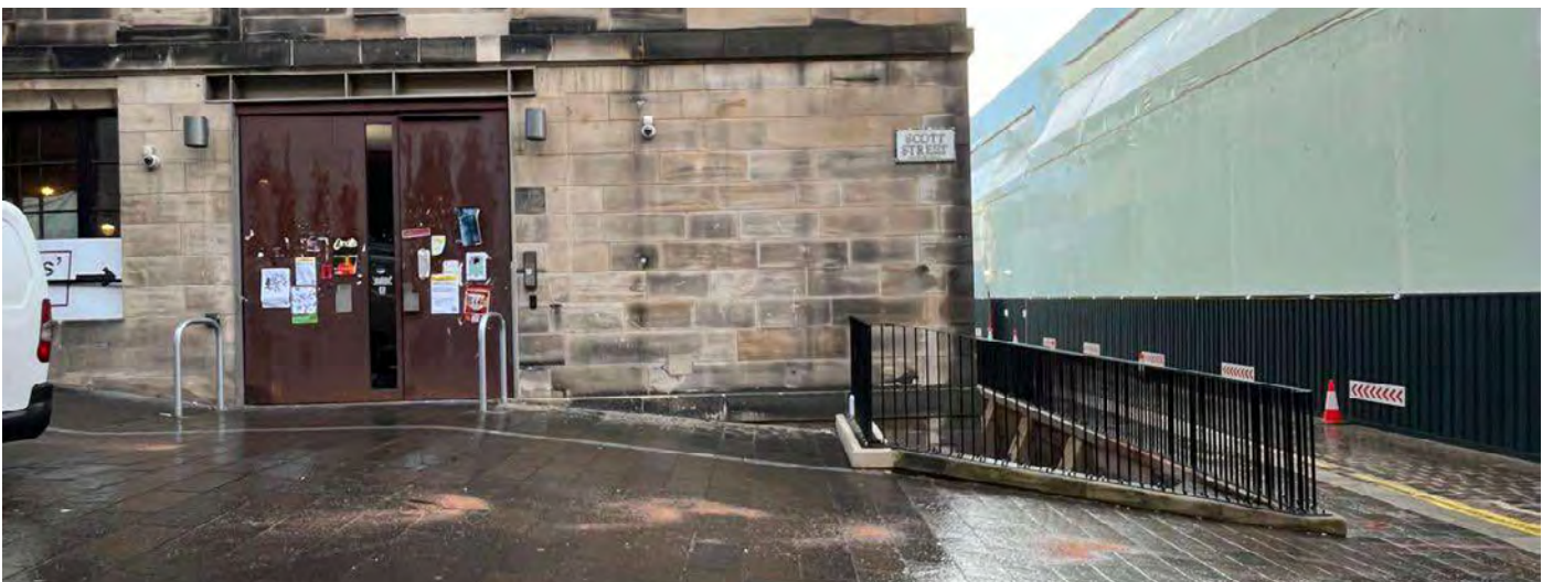
GSA Student Association Drop Kerb (Scott Street)