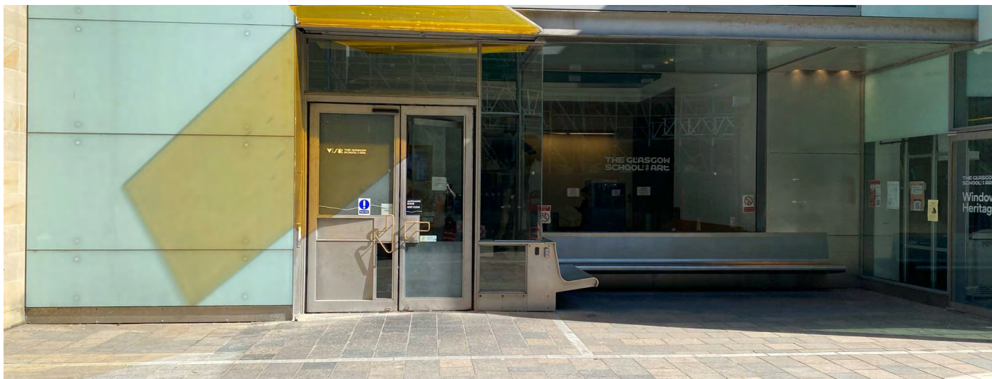
Reid Building Main Entrance (Renfrew Street)

The best drop off point for a car or taxi is at the drop kerb outside at the Reid Building Main Entrance at 164 Renfrew Street. There are additional drop off points with drop kerbs at the corner of Scott Street and Renfrew Street, outside the GSA library building or outside the Student Association on Scott Street. If you have any further questions around access please contact j.farrell@gsa.ac.uk if required.