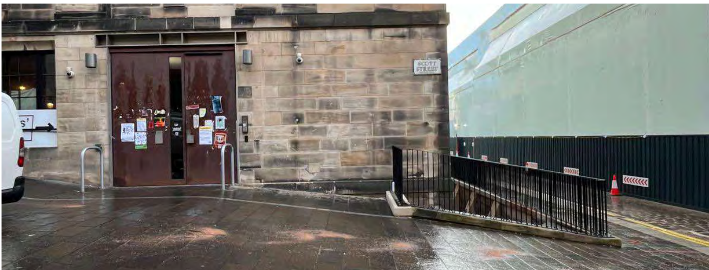
GSA Student Association Drop Kerb (Scott Street)