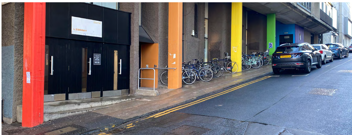
GSA Library Drop Kerb (Scott Street)