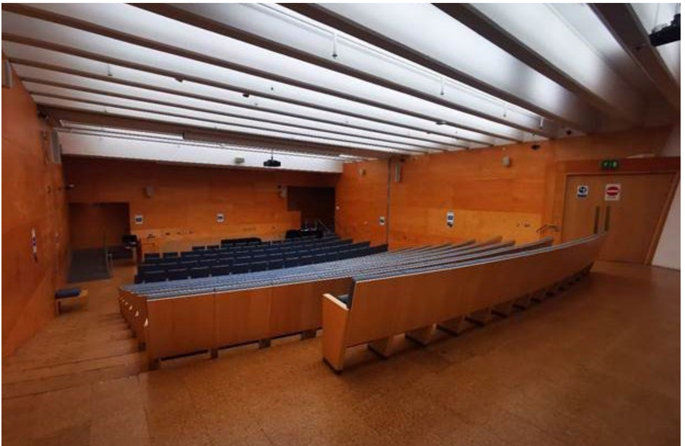
Internal view of Reid Lecture Theatre

There are toilets (including an accessible toilet) located outside of the Lecture Theatre and also gender neutral and accessible toilets with closed stalls on the ground floor next to the Reid Gallery