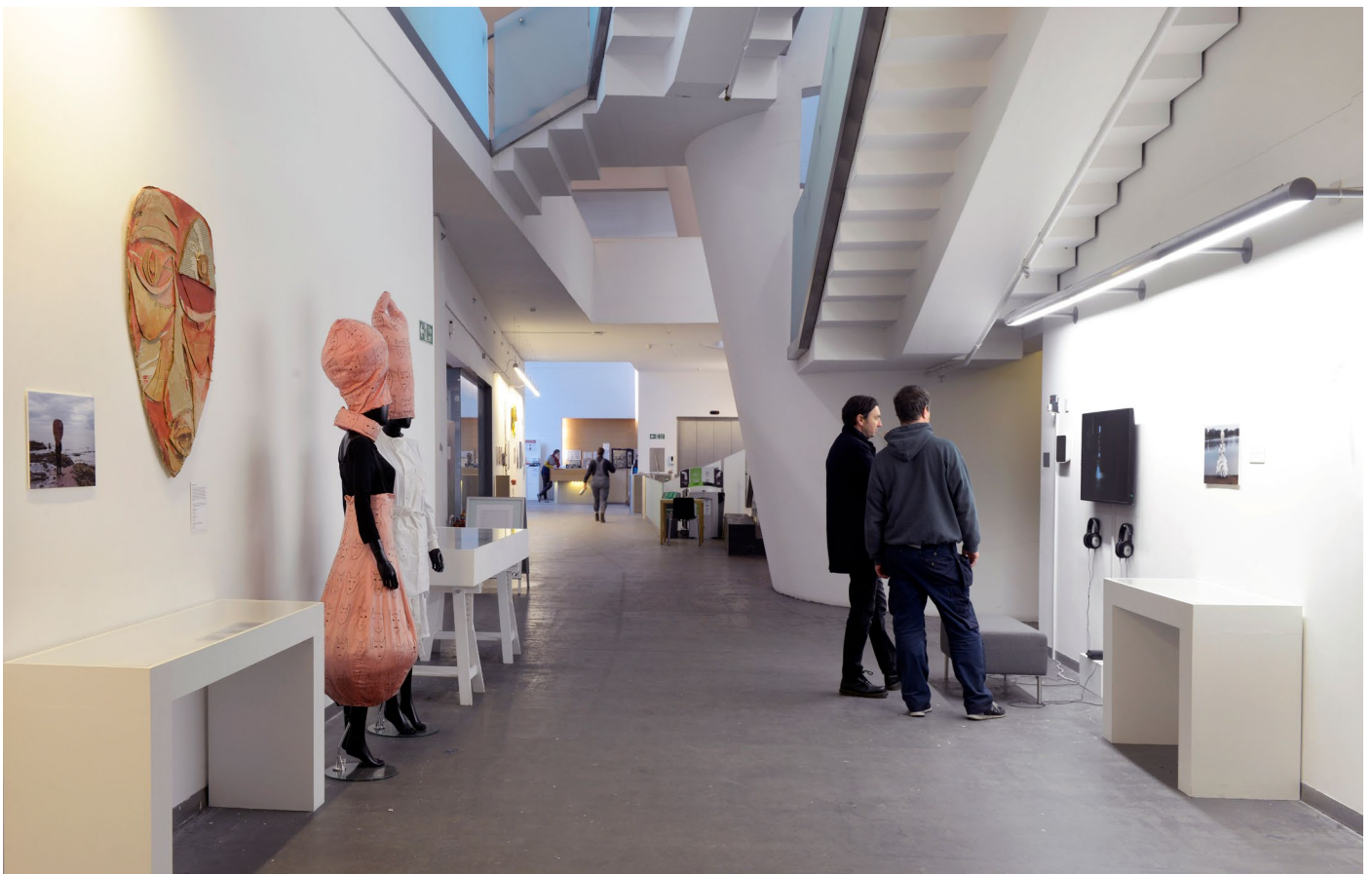
Internal view of Reid Ground Floor Corridor

Seating is available to the right of the main reception for visitors, as well as a concrete bench further along the corridor opposite the toilets. There are gender neutral toilets (including an accessible toilet) located on the ground floor next to the Reid Gallery. All toilets are closed stalls.