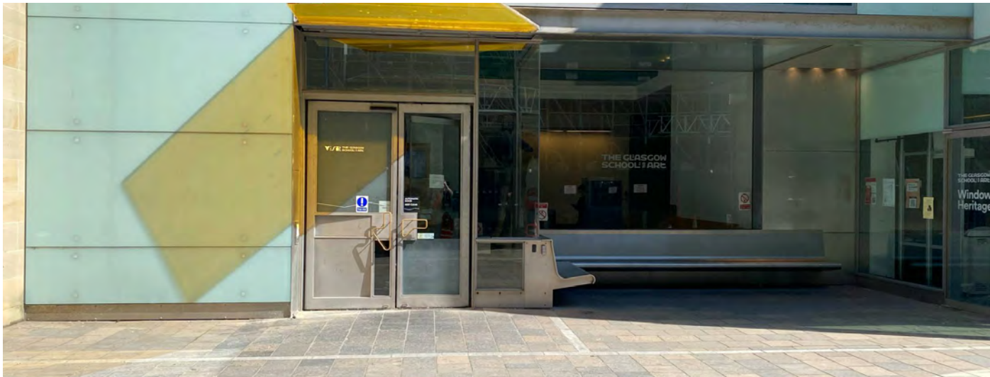
Reid Building Main Entrance (Renfrew Street)

The best drop off point for a car or taxi is at the drop kerb outside at the Reid Building Main Entrance at 164 Renfrew Street. There are additional drop off points with drop kerbs at the corner of Scott Street and Renfrew Street, outside the GSA library building or outside the Student Association on Scott Street. If you have any further questions around access please contact j.farrell@gsa.ac.uk if required.