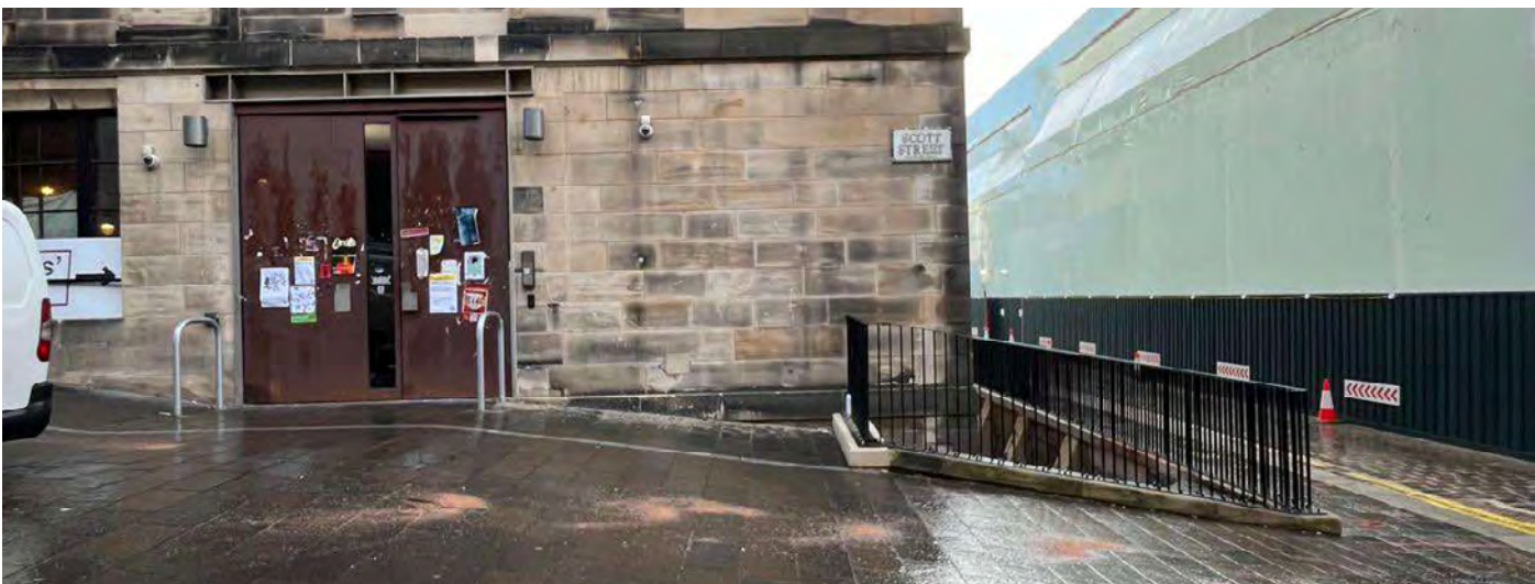
GSA Student Association Drop Kerb (Scott Street)