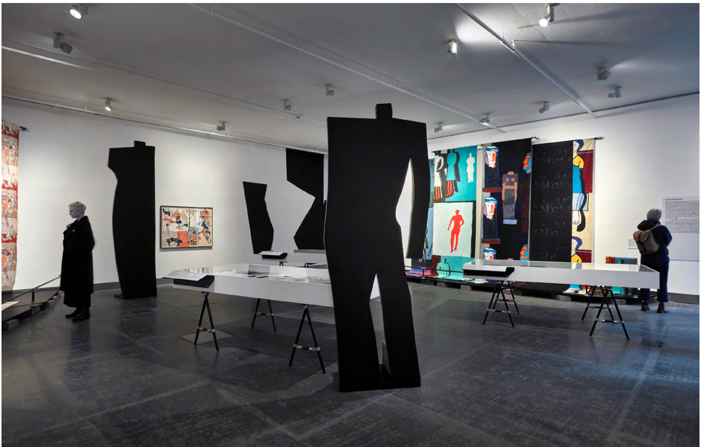
Internal view of Reid Gallery

Seating is available to the right of the main reception for visitors, as well as a concrete bench further along the corridor opposite the toilets. There are gender neutral toilets (including an accessible toilet) located on the ground floor next to the Reid Gallery. All toilets are closed stalls.